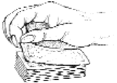
turning the card over

Turn the card over away from you to ensure that you do not see the card before the other players. The faster you turn over the card, the sooner you will see it.